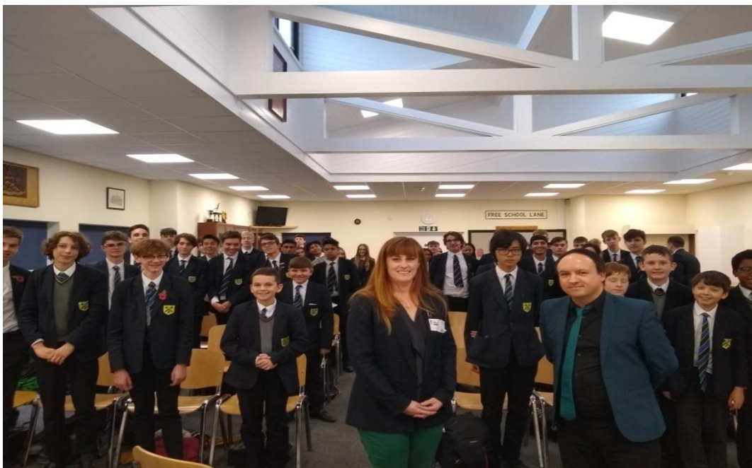
Visit from Rochester & Strood MP Kelly Tolhurst: Nov 19