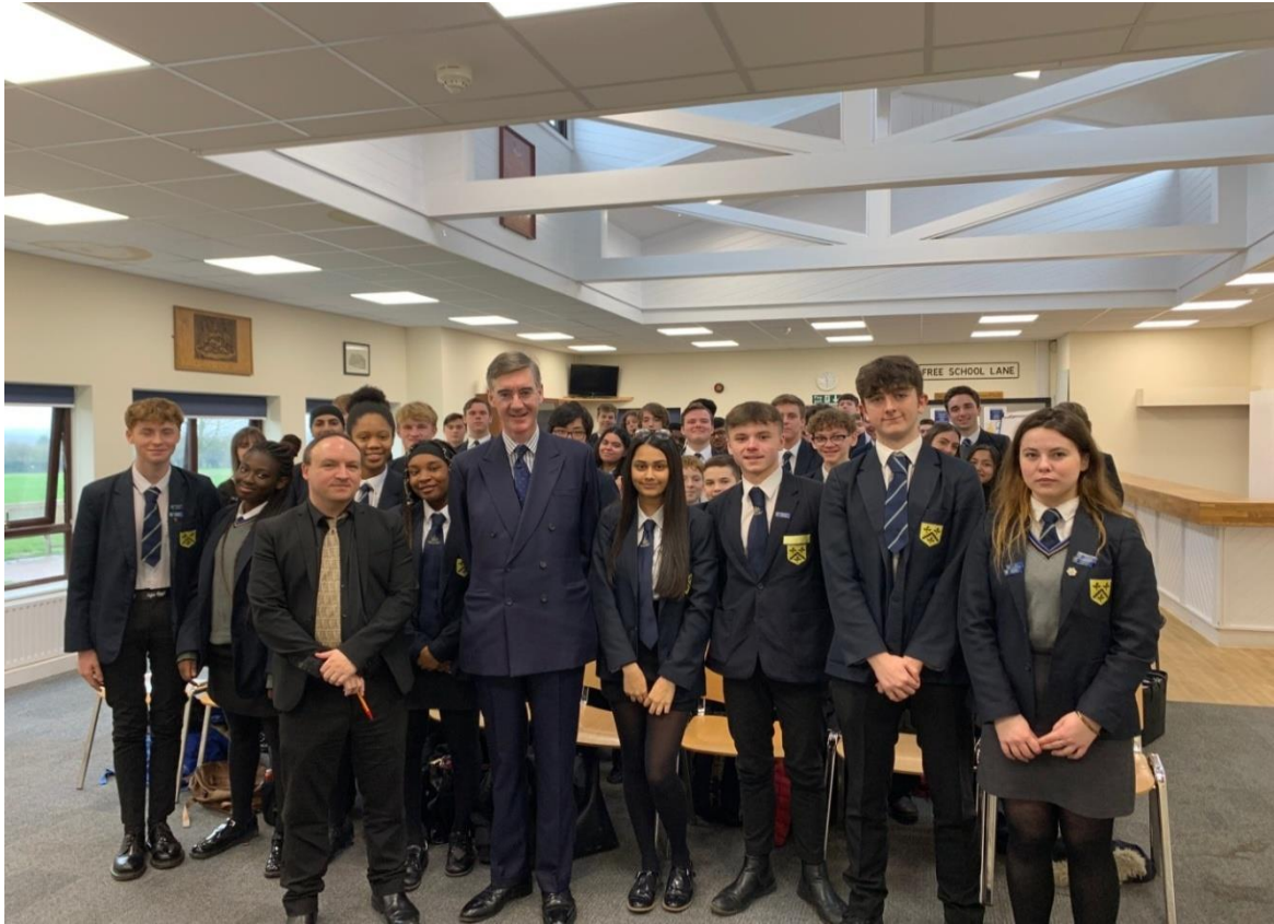
Visit from a member of the cabinet Jacob Rees Mogg: Jan 20